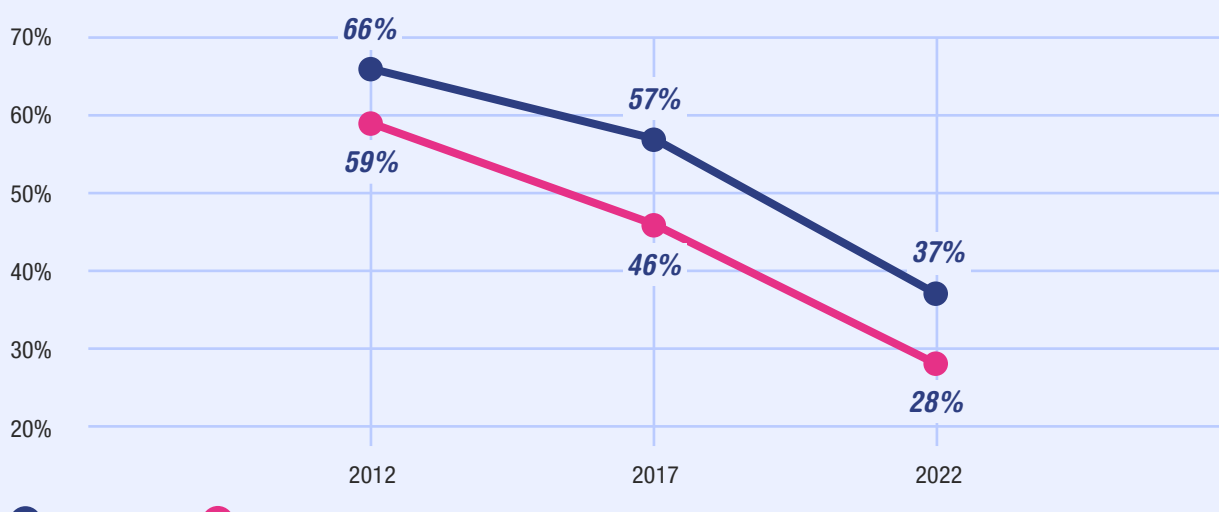
Figure 1: Participants who feel happy with their life as an LGBTQ+ person in Scotland

This report was then commissioned to explore issues being faced by trans young people in Scotland. In our main Life in Scotland for LGBT Young People report, we covered a wide range of topics including health, education, community, work life, hate crime, the experience of coming out and the media. In the report, we noted that many trans participants' experiences in these areas were poorer than those of cisgender participants. In particular, we asked participants "How happy do you feel with your life as an LGBTQ+ young person in Scotland?" As shown in Fig. 1 below, trans participants reported lower levels of happiness with their lives than participants overall, and the percentage of respondents feeling "Happy" or "Very happy" has fallen steadily each time we have surveyed LGBTQ+ young people since 2012.